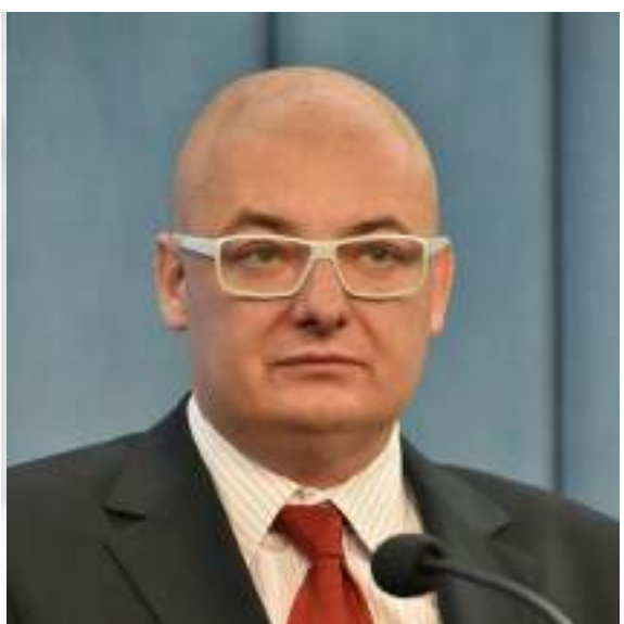
Michał Tomasz Kamiński, Vice Marshal of the Senate of Poland. Senator