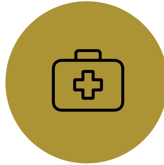
TACTICAL FIRST AID KITS

Objective: Help people preserve limbs, essential body functions, and overall musculoskeletal system