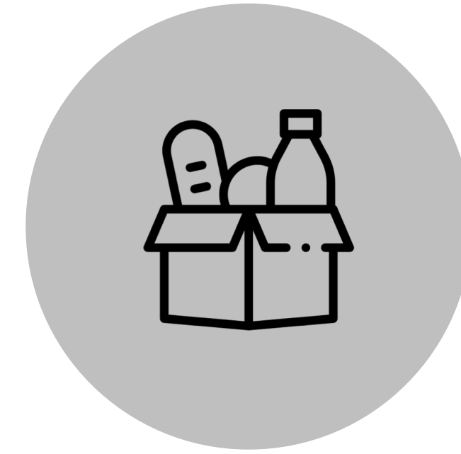
SORTED RATION PACKAGE WITH THE PRE-SET NUTRITION VALUE

Objective: Secure imminent emergency response before medical assistance is available