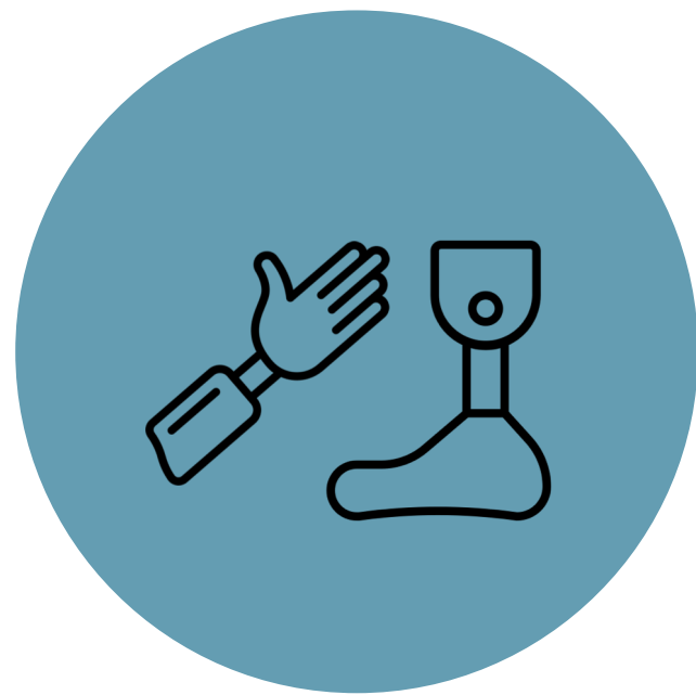
EXTERNAL FIXATION DEVICES

CRITICAL AID ITEMS THAT FILL SPECIFIC NEEDS OF PEOPLE WHERE EFFORTS ARE INSUFFICIENT